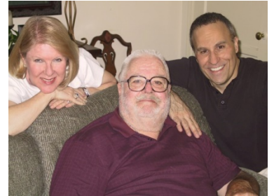
William Windom as Matthew Decker

In an adventure that spans centuries, Captain Kirk fights alongside a U.S.S. Enterprise from the past to stop the devastating "Doomsday Wars" that should never have happened. In a universe forever changed by those events, the crew of the Enterprise must once again battle the powerful juggernaut known as the "Doomsday Machine."